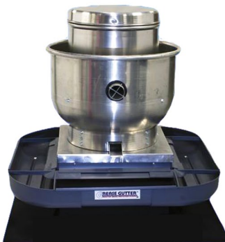
GREASE GUTTER ROOFTOP GREASE PROTECTION SYSTEMS HIGH CAPACITY