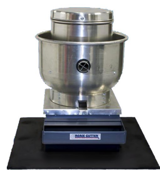
GREASE GUTTER ROOFTOP GREASE PROTECTION SYSTEMS SIDEKICK