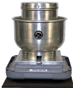
GREASE GUTTER ROOFTOP GREASE PROTECTION SYSTEMS ORIGINAL

Use The Original Grease Gutter with True 360° duct design for low to moderate grease discharge applications. or The High Capacity Grease Gutter 360° duct design for use in high grease discharge applications. And The Grease Gutter Sidekick Single sided design for applications where the other Grease Gutter units won't fit.